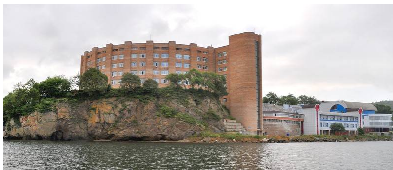
National Scientific Center of Marine Biology FEB RAS

Vladivostok is the largest scientific and educational center of the Far East region, including the Far Eastern Federal University, Far Eastern Branch of Russian Academy of Sciences and numerous institutes of the Federal Agency of Scientific Organizations (FANO). Other major scientific organizations are the Pacific Research Fisheries Center (TINRO Center) and the Far Eastern Regional Hydrometeorological Research Institute (DVNIGMI). The Society for Study of the Amur Region (OIAK), the oldest scientific organization in the Russian Far East, now operates as Primorye regional department of the Russian Geographical Society.