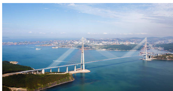
Russky Island bridge

Please find more information about the city at Wikipedia http://ru.wikipedia.org , website of Primorsky Territory Administration http://primorsky.ru/Vladivostok and http://www.vl.ru/ .